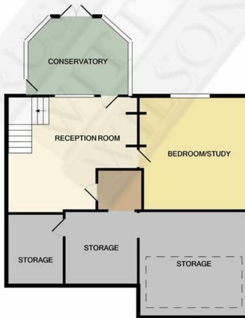
GARDEN LEVEL APPROX. FLOOR AREA 831 SQ.FT. (77.2 SQ.M.)

TOTAL APPROX. FLOOR AREA 2350 SQ.FT. (218.3 SQ.M.) Whilst every attempt has been made to ensure the accuracy of the floor plan contained here, measurements of doors, windows, rooms and any other items are approximate and no responsibility is taken for any error, omission, or mis-statement. This plan is for illustrative purposes only and should be used as such by any prospective purchaser. The services, systems and appliances shown have not been tested and no guarantee as to their operability or efficiency can be given. Made with Metropix ©2021