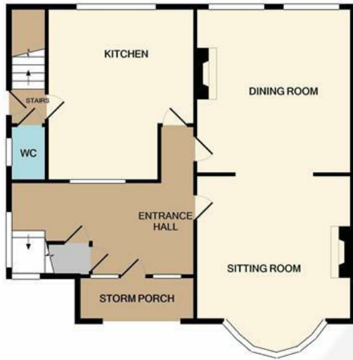
ENTRANCE FLOOR APPROX. FLOOR AREA 779 SQ.FT. (72.4 SQ.M.)