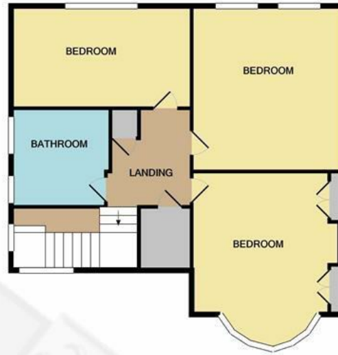
2ND FLOOR APPROX. FLOOR AREA 740 SQ.FT. (68.7 SQ.M.)